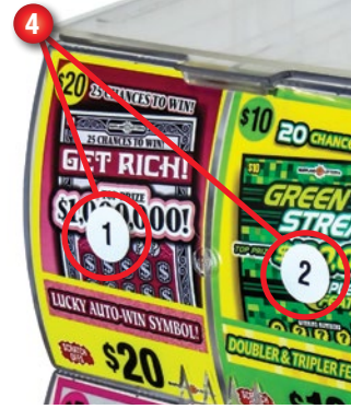
Dispenser Number Sticker