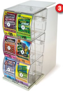
3-High Dual Dispenser Side Security Shield