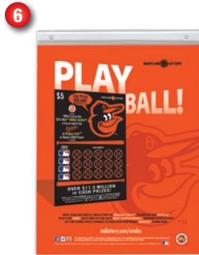
Acrylic Sign Holder