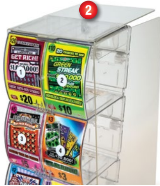
3-High Dual Dispenser Top Security Shield