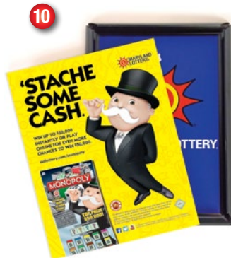
Snap Frame w/ 2-Sided Insert