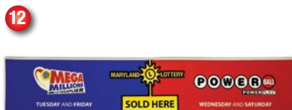
Horizontal Jackpot Games Strip Sign