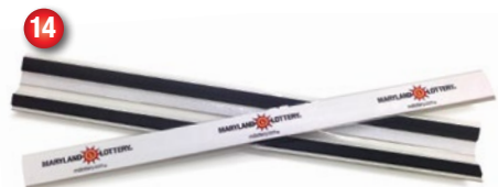
Magnetic Strip Sign Holder