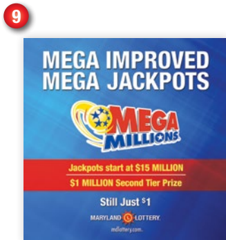
Violator (w/ adhesive mounting stand)