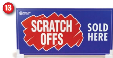
ITVM Topper (magnetic feet and insert)