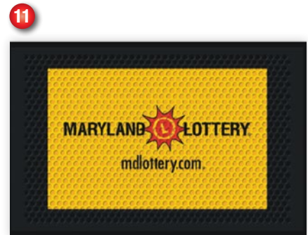
Rubber Floor Mat (3' x 2')