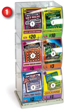
3-High Dual Dispenser